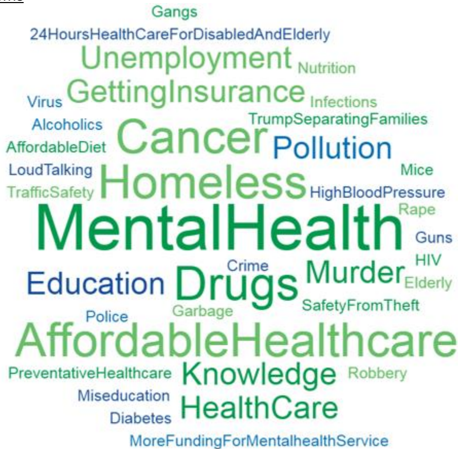
Figure 6: Results from the Delphi Method for discussing Top Concerns

After participants finished discussing all their health concerns in the community, they were asked to narrow the list and to point out the biggest priorities for health in their community. Results from this conversation are shown in the word cloud in Figure 6, which represents exact words and phrases used by participants in response to the question. Homelessness, cancer, mental illness, and violence were the top concerns that were frequently mentioned by participants across all four locations.