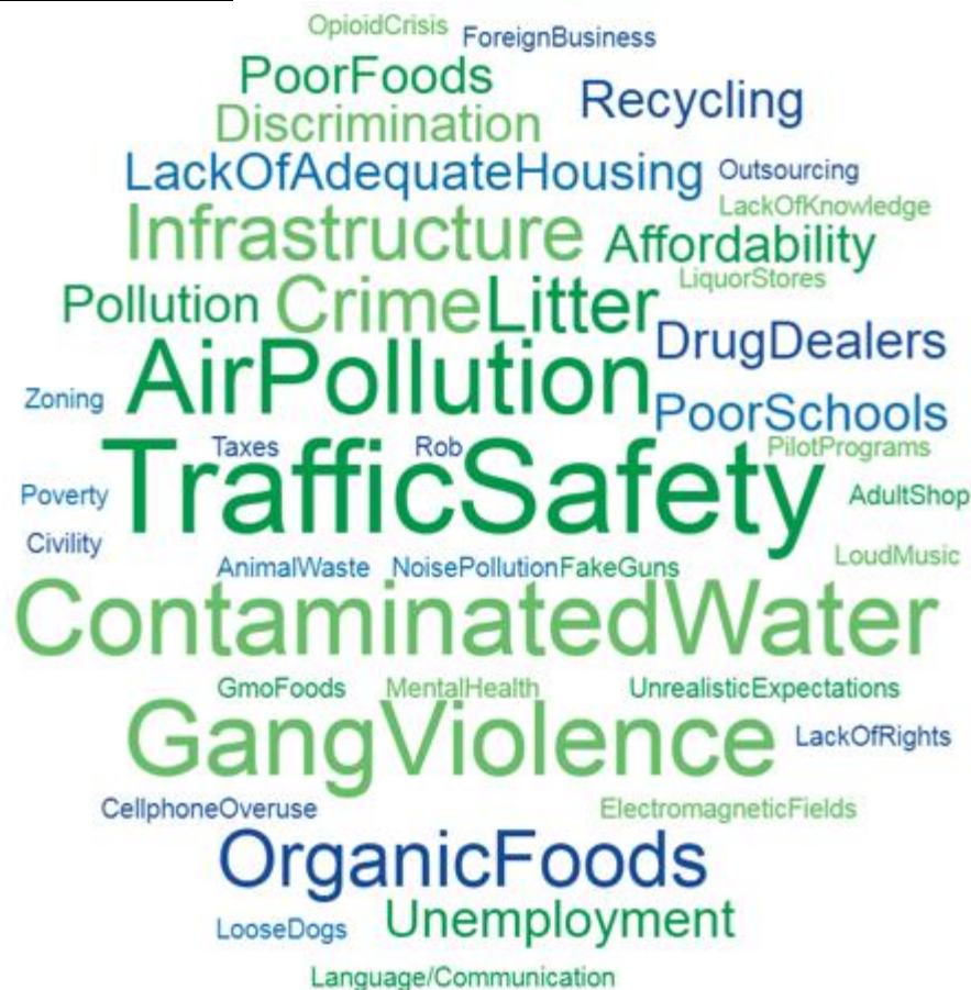
Figure 5: Results from the Delphi Method for discussing Healthy Environment

When asked to identify factors affecting the general health environment, participants mentioned air and water quality, food safety, violence, and distracted driving as the leading issues affecting their respective communities. Results from this brainstorm are shown in the word cloud in Figure 5, which represents exact words and phrases used by participants in response to the question. Smoking in public areas was cited as a concern, as were rodent and insect infestations, litter, asbestos, and abandoned homes, especially in the Hempstead area. Participants also voiced their concern with the increasing gang violence, which was particularly significant in the Riverhead focus group session. Abusive relationships and bullying were also mentioned. Speeding and failure to stop at a stop sign were a main concerns for traffic safety. Regarding food safety, participants mentioned chemically-treated produce, genetically-modified food, and lack of access to organic food in most low-income communities as the top food safety