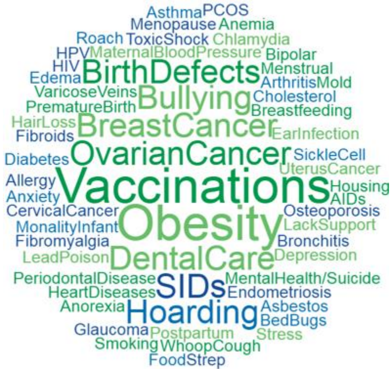
Figure 3: Results from the Delphi Method for discussing Women, Infants, and Children

Participants were asked to list what they believed to be top health concerns affecting women, infants, and children. Results from this brainstorm are shown in the word cloud in Figure 3, which represents exact words and phrases used by participants in response to the question. Breast and ovarian cancers were the leading concerns voiced by participants regarding women's health. Poor sex education and unsafe sex practices, as well as lack of using protection, were cited as the main causes of teen pregnancy and the spread of sexually-transmitted diseases STDs. Mental health, bullying, mumps, measles, and lead poisoning were among the most cited concerns affecting children. There were no health concerns discussed that affected infants.