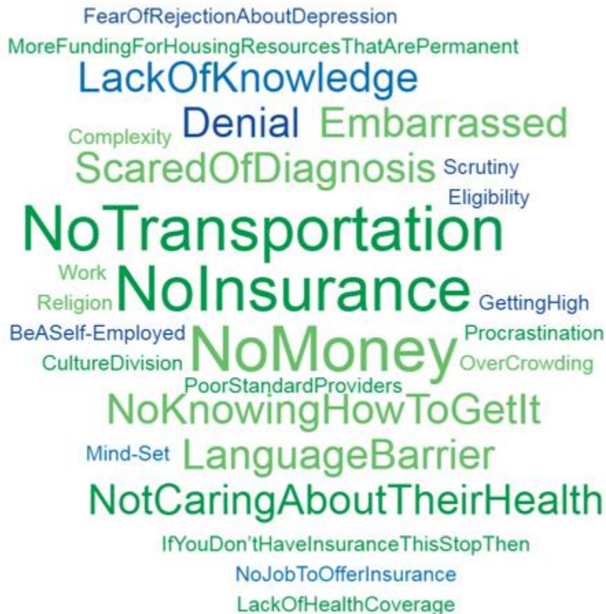
Figure 7: Results from the Delphi Method for discussing Barriers to Treatment