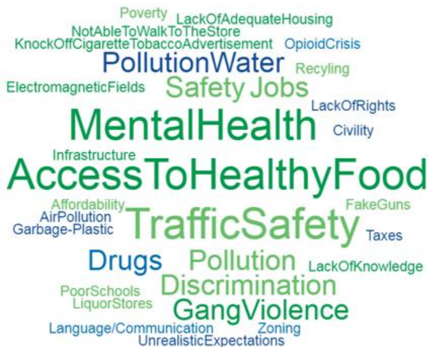
Figure 10: Results from the Delphi Method for discussing Neighborhood and Built Environment

Participants were asked to speak about factors in their neighborhood and environment that they believed to affect their health and wellbeing. Results from this brainstorm are shown in the word