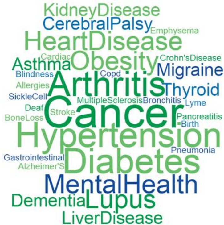
Figure 1: Results from the Delphi Method for discussing Chronic Illnesses

Participants were asked to brainstorm for common chronic diseases. Results from this brainstorm are shown in the word cloud in Figure 1, which represents exact words and phrases used by participants in response to the question. All groups easily identified many different diseases, though with some confusion over type or category. Overall, cancer, hypertension, and arthritis were widely mentioned across all four locations. Cancer was often mentioned along with stress. Additionally, participants frequently voiced their concern about the cause and effect relationship between the difficulty of access to healthy foods and chronic diseases such as cancer, hypertension, and obesity. Smoking and tobacco use were rarely mentioned as chronic diseases for all four focus groups.