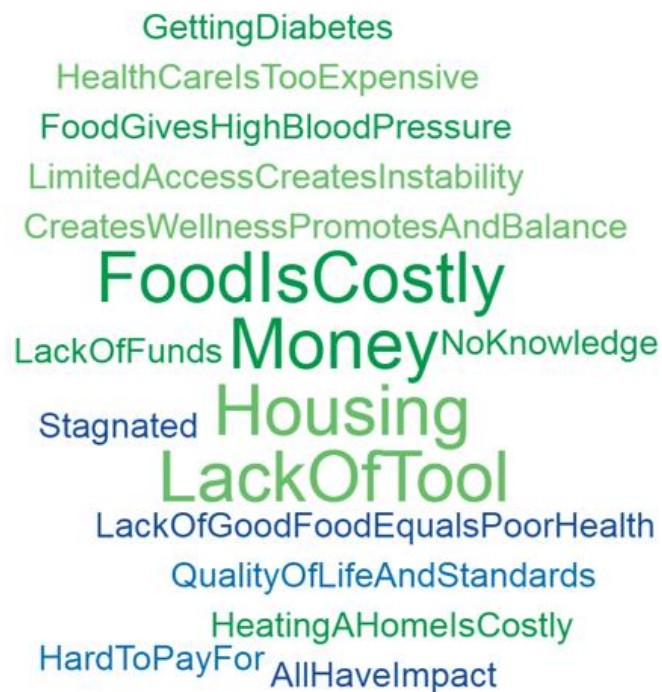
Figure 8: Results from the Delphi Method for discussing Economic Stability