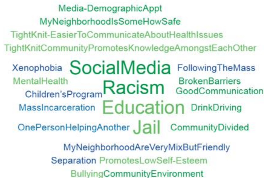
Figure 11: Results from the Delphi Method for discussing Social, Family, and Community

Participants were also asked to speak about social, family, or community-related challenges and the effects of those challenges on their perceived wellbeing and quality of life. Results from this brainstorm are shown in the word cloud in Figure 11, which represents exact words and phrases used by participants in response to the question. Education, lack of parental involvement (sometimes due to their own health issues or other poverty-related challenges), incarceration, and racism were among the leading concerns. Participants also expressed concerns about the adverse effects of social media, including addiction to social media, lack of face to face interaction, and cyberbullying on children.