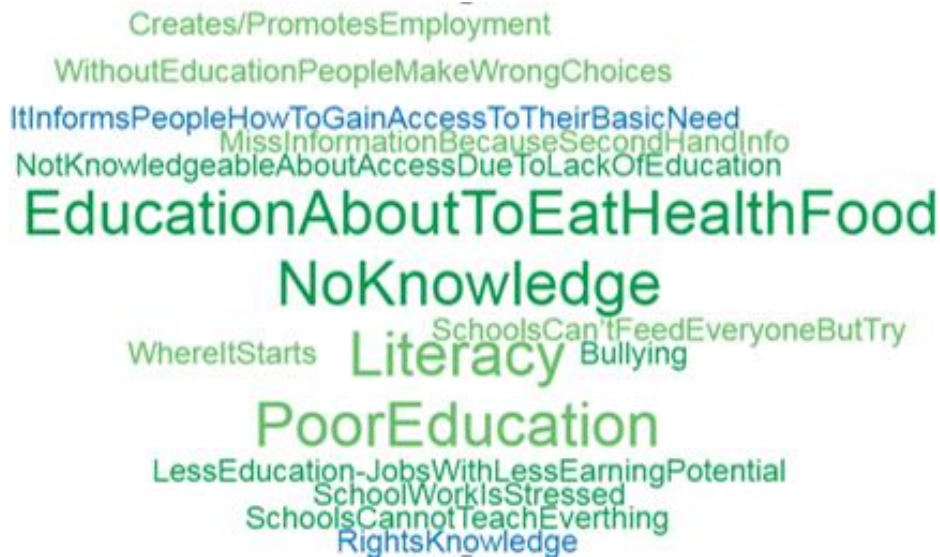
Figure 9: Results from the Delphi Method for discussing Education

When asked to speak about education-related challenges in their communities and the effect of these challenges on participants’ perceived wellbeing and access to healthcare, participants mentioned leading concerns including poor school systems and education quality and illiteracy, as well as lack of adequate health education about diseases, treatment options, healthy food, and providers. Results from this brainstorm are shown in the word cloud in Figure 9, which represents exact words and phrases used by participants in response to the question.